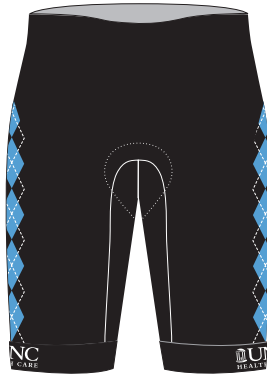
Free Tri Shorts - FRONT