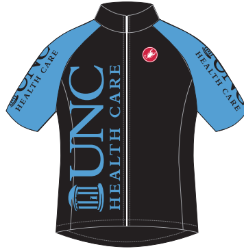
Training Jersey - FRONT