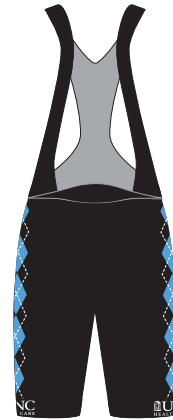
Team Bibs - FRONT