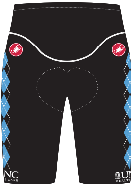
Free Tri Shorts - BACK